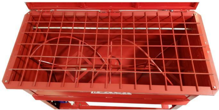
SPIRAL RIBBON BLENDER

Pack Manufacturing Batch Mixers are designed for uniform blending of a wide variety of materials, such as peat, bark, soil, sand, chemicals, and fertilizers. Our Batch Mixers have spiral ribbon blenders which pull material from the sides of the hopper toward the center. Simply add your mix ingredients to the easy access top safety lid and press start. The batch will be thoroughly mixed in just 3 - 5 minutes. Mixed media is easily removed from the center discharge hatch. Pack Mfg. Batch Mixers use direct drive transmissions, which eliminate the problems of chain and sprockets.