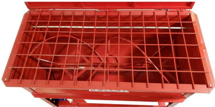
SPIRAL RIBBON BLENDER

Pack Manufacturing Batch Mixers are designed for uniform mix blending and works with a wide variety of materials, such as peat, bark, soil, sand, chemicals, and fertilizers. Our Batch Mixers have spiral ribbon blenders which pull material from the sides of the hopper toward the center. Simply add your mix ingredients to the easy access top safety lid and press start. The batch will be thoroughly mixed in just 3 - 5 minutes. Mixed media is easily removed from the center discharge hatch. Pack Mfg. Batch Mixers use direct drive transmissions, which eliminate the problems of chain and sprockets.