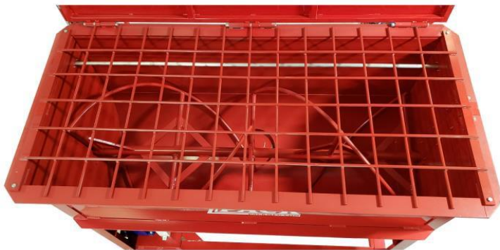
SPIRAL RIBBON BLENDER

Pack Manufacturing Batch Mixers are designed for uniform blending of a wide variety of materials, such as peat, bark, soil, sand, chemicals, and fertilizers. Our Batch Mixers have spiral ribbon blenders which pull material from the sides of the hopper toward the center. Simply add your mix ingredients to the easy access top safety lid and press start. The batch will be thoroughly mixed in just 3 - 5 minutes. Mixed media is easily removed from the center discharge hatch. Pack Mfg. Batch Mixers use direct drive transmissions, which eliminate the problems of chain and sprockets.