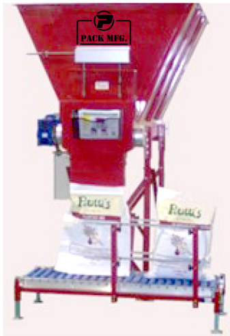
CUSTOM BAG KICKER