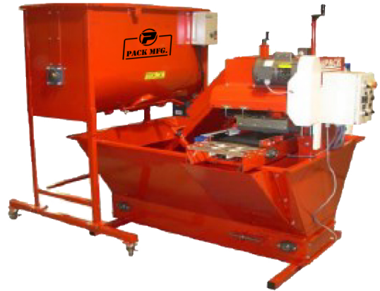
Optional Mixer Combination for Increased Volume & Production