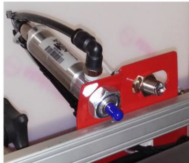
Photo Eye Sensor w/ Smart Delay