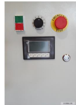
Simplified Controls for Easy Operation