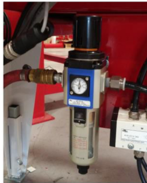
Easy Read Air Gauge